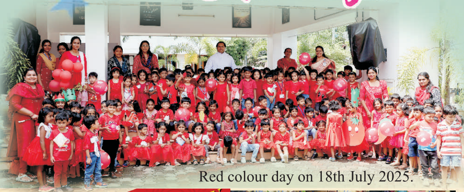
Red colour day on 18th July 2025.