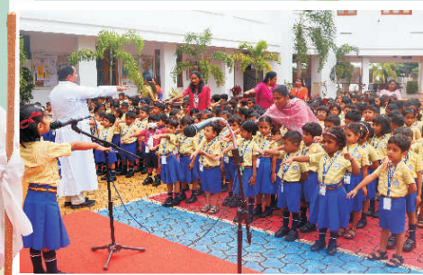
Independence day celebration on 14th August 2025

Christ Nagar Central School hosted the Kids' Literary Fest 2025, a vibrant platform for young students to express their creativity and talent. The event featured pencil drawing, crayon drawing, and digital painting competitions, encouraging self-expression and artistic flair.