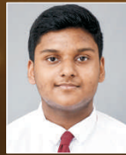
P SHANKAR MAHADEV