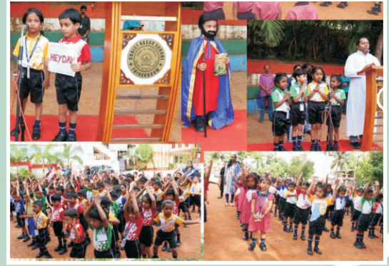
KG students celebrated St. Thomas Day on 2nd July 2025.