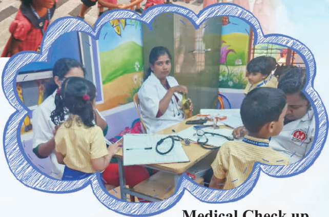
Medical Check up