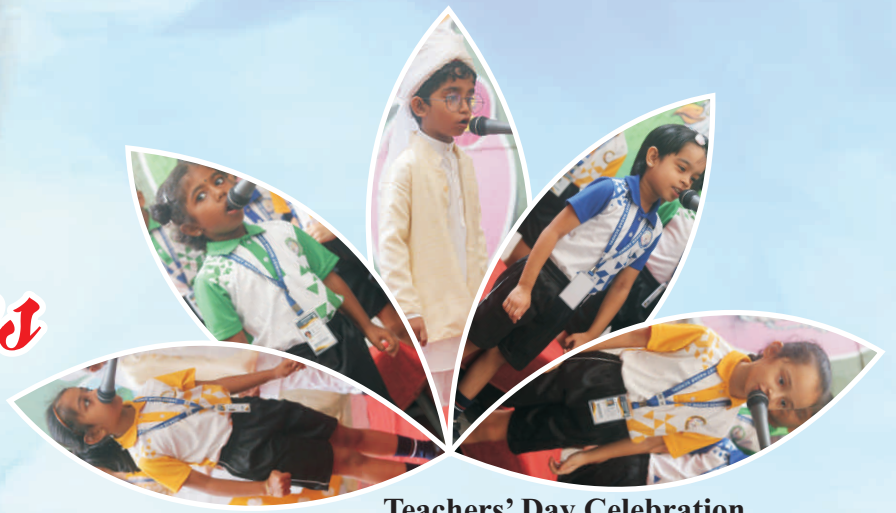
Teachers' Day Celebration